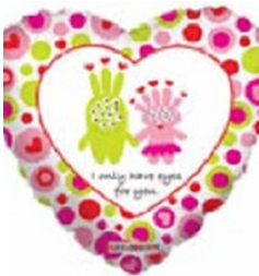
I Only Have Eyes For You Monsters