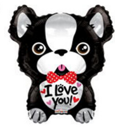
I Love You French Bulldog Shaped