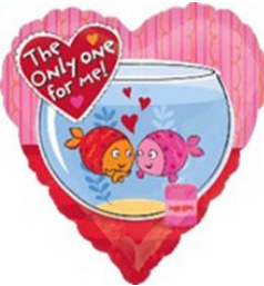
The Only One For Me