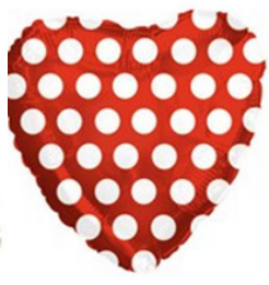
Red White Polka Dots Heart Shaped