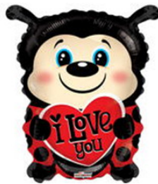
I Love You Lady Bug Shaped