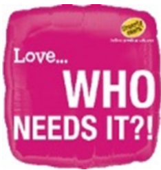
"Love...Who needs it"