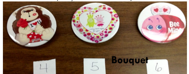
( 2 1/4 Inch) Buttons 4-6