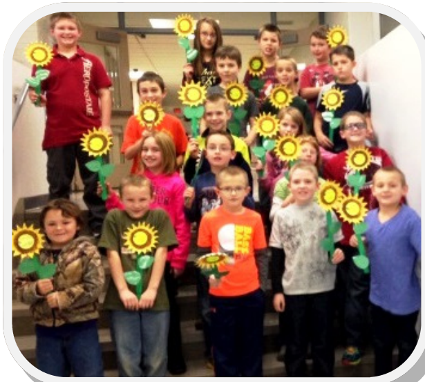
New Auburn elementary third graders participated in a Nutrients Grow program presented by New Auburn agriculture students/FFA members.

New Auburn's Exploratory Agriculture class recently created and presented additional programs related to the Nutrients for Life ~ Helping Our Community Grow pro-