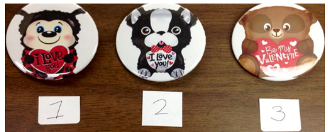
( 2 1/4 Inch Buttons 1-3)