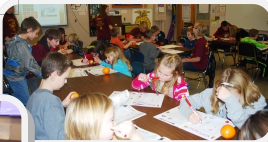
Second graders eagerly participate in a "Grocery Connections" activity. Students gained an understanding of the connection between plant growth and food.

school students created flowers. Each flower included a photograph of the pre-school student at the center. Students made important connections of what is required to grow healthy plants and how it starts with the soil and its important nutrients. They also related the idea that individuals who learn new information, grow in knowledge.