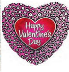
Happy Valentines Day Pink Cheetah