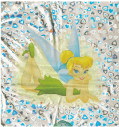
Tinkerbell Heart Shaped