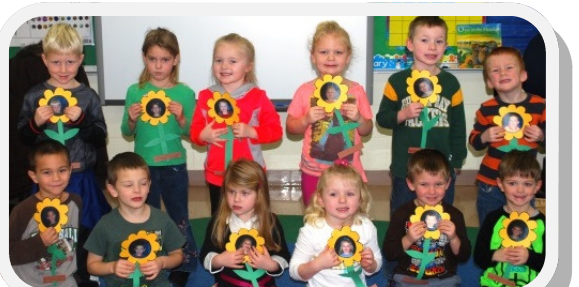
"Blooming With Knowledge" was an agriculture-based learning activity for the pre-school students.

What made this project unique was gaining random student and staff comments, which