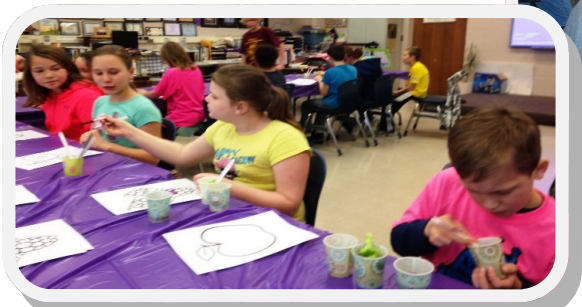
New Auburn elementary fourth grade students gained knowledge related to the connection between key fruit and vegetable products and the important link that soil and nutrients provide. New Auburn's FFA chapter members emphasized important points as part of the Nutrients for Life program.

New Auburn's Exploratory Agriculture class recently created and presented additional programs related to the Nutrients for Life ~ Helping Our Community Grow pro-