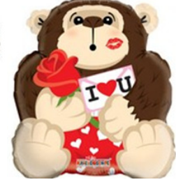
Gorilla In Love