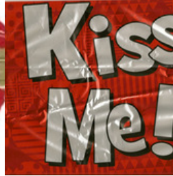
Kiss Me (Heart Shaped)