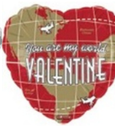
You Are My World Valentine