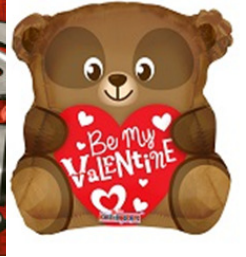
Be My Valentine (Bear Shaped)